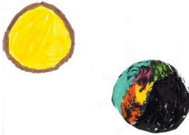
Figure 5. Relative positions of the sun and the earth: places facing the sun have day

Children drew or used collage in their representations of the phenomenon. In a large proportion of children’s work, the part of the earth that is not facing the sun is coloured black, whereas the one facing it is coloured with different bright colours (see Figures 5 and 6).