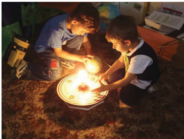
Figure 4. Investigating the phenomenon of day and night

Most of the groups presented and explained their findings in class. Below is one of the most accurate presentations: