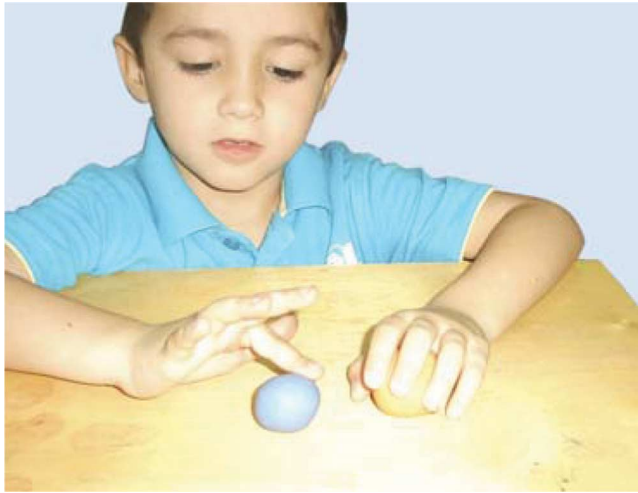
Figure 7. This boy used his middle finger to rotate the blue ball around itself while rolling it around the yellow one (sun) which he holds still

Some of the children wanted to show the movement of the moon as well: