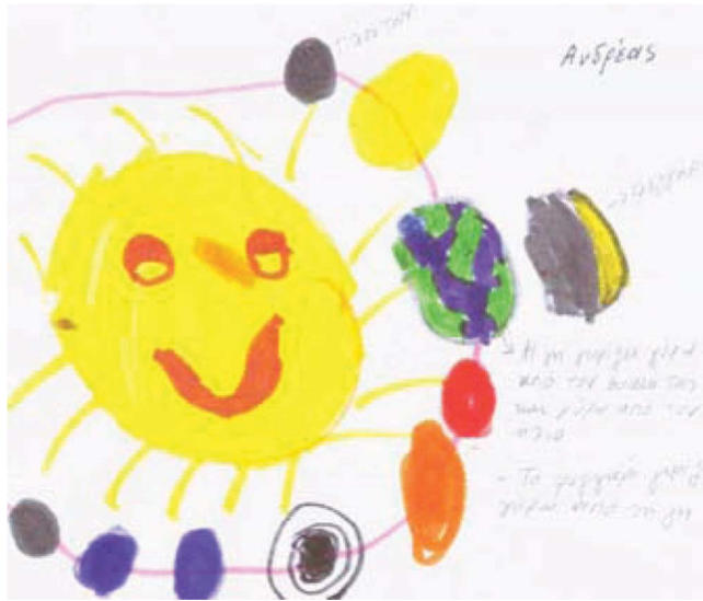
Figure 2. The solar system. The moon is placed next to the earth. The notes on the picture dictated by the child and written by the teacher read: “The earth rotates around itself and around the sun. The moon rotates around the earth”