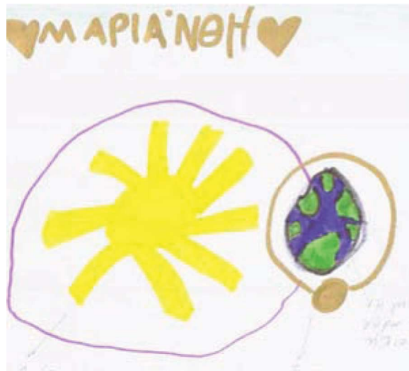
Figure 3. Sun, earth, and moon and the orbits of the last two

C: Because the sun moves in the sky. Slowly he goes higher and higher and then slowly he goes away.